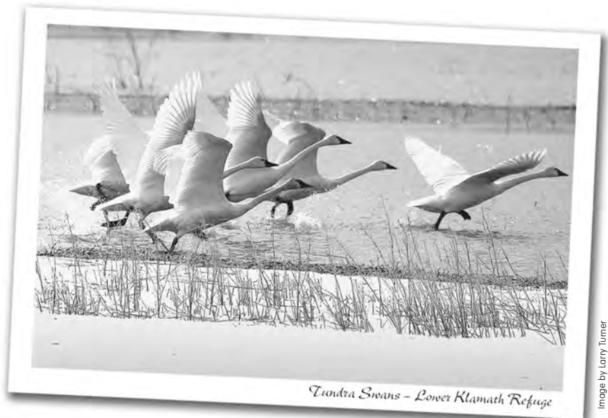
Tundra Swans - Lower Klamath Refuge