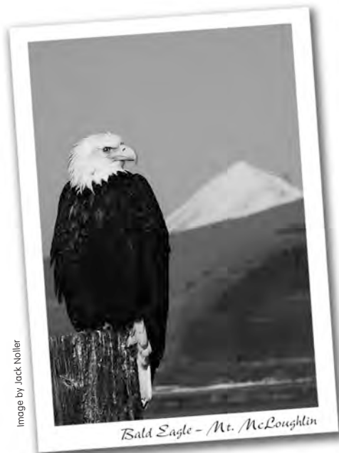
Bald Eagle - Mt. McLoughlin

* See www.WinterWingsFest.org for more details on the photography contest